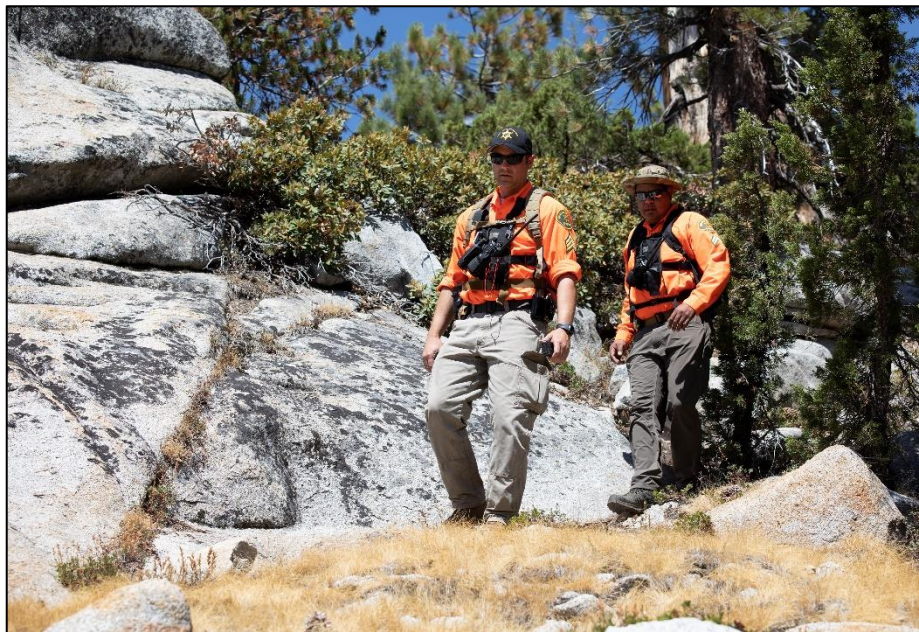
Training for a marathon, half marathon, or even a 5K takes time. Your training plan should add mileage or intensity slowly to let your body adapt to the new activity without causing an injury.

Maybe the grind of the first responder life allowed you to reflect on your blessings and cultivate personal gratitude. Maybe the intense pressure taught you the importance of taking mindful moments to take